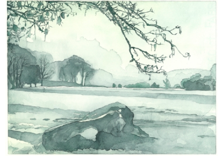
Summer Solstice (2008)